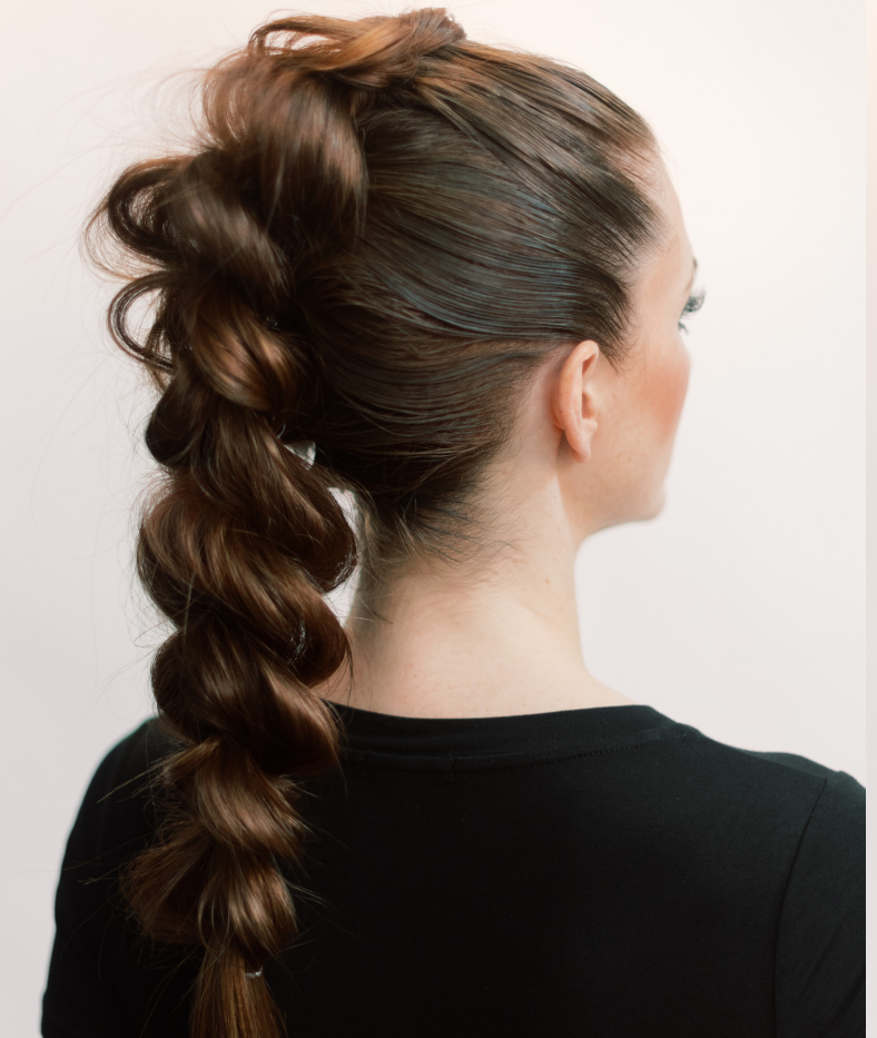
high pony curl